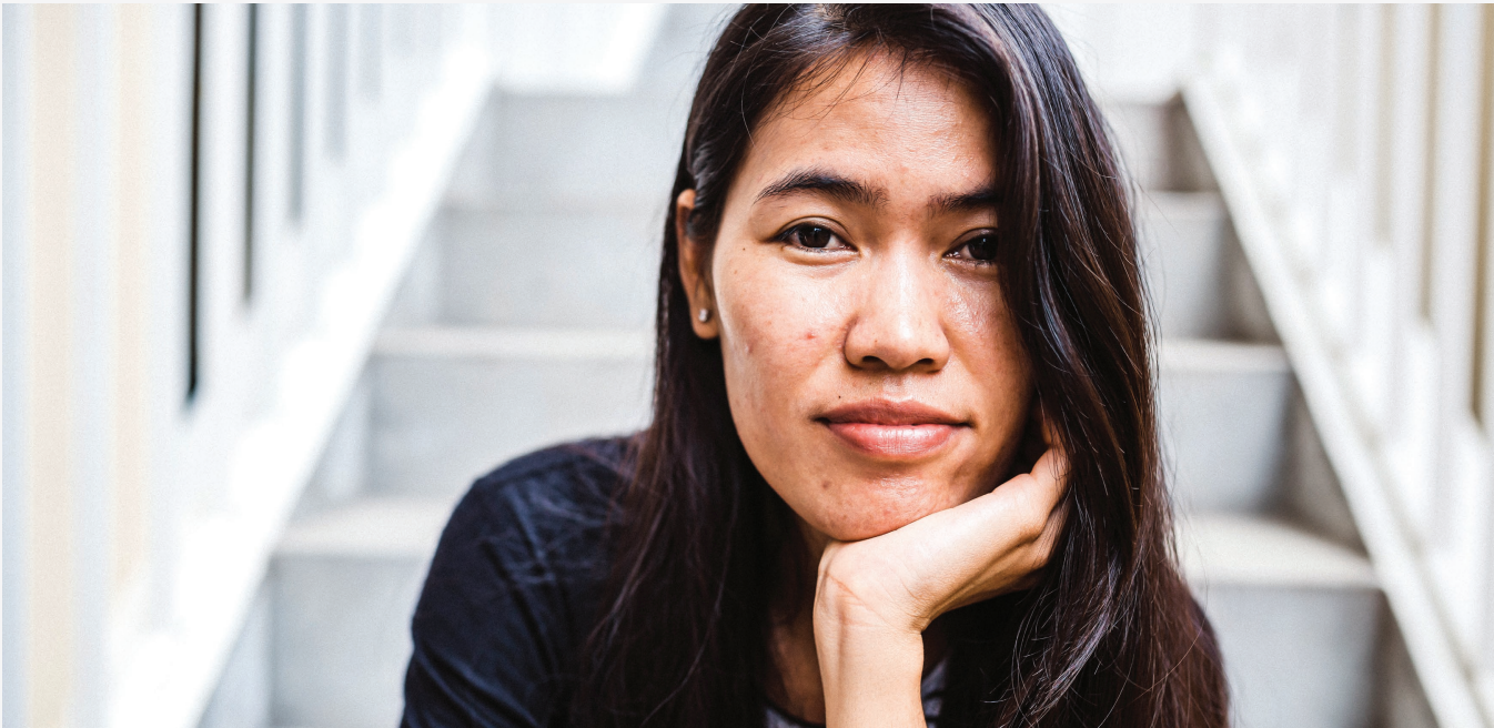
Leakena is a pseudonym for a real client. Images and some details have been changed to protect the identities of those in our care.

Please give generously today! ratanak.org/donate