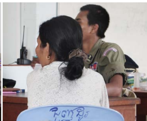
Anti-Trafficking Police apprehend and detain two traffickers.