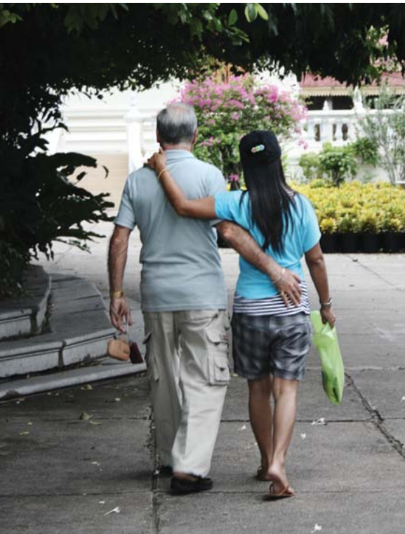
Another example of a foreigner with wealth exploiting one without – an all too common scene.

But even once they reach out for help, it can be difficult to bring victims home. Our latest program seeks to respond to these pleas for help. We're a small charity, and yet we've recently been trusted with the privilege of helping even more Cambodians in need of rescue around the world. A few months ago, the United Nations and IOM (International Organization for Migration) asked Ratanak to participate in this new initiative to help Cambodians who have been trafficked overseas. Ratanak is working together with an NGO in Cambodia called Chab Dai. Our new repatriation program seeks to help victims of exploitation by :