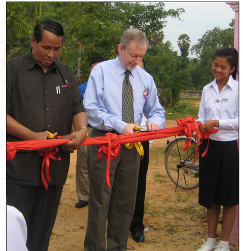
Library opening ceremonies.

What a wonderful thing it was to see kids that would, under normal circumstances, remain largely uneducated, isolated and vulnerable learning and interacting with the larger world.