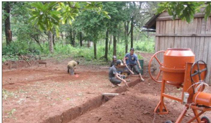
BELOW: New Dorm under construction.

the construction of the dorm building in order to keep costs down. This program will provide students with free accommodation while they study at one of the local government schools. Student rent will be paid, not in cash, but in labour as they work with the adjacent CAMA sustainable-agricultural training facility. This will accomplish several goals. Students will be able to obtain an education while they support