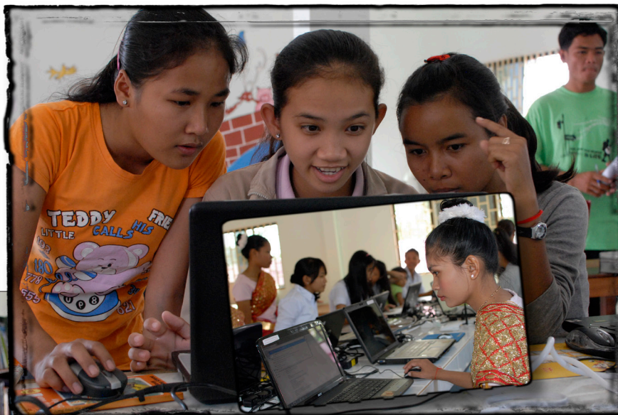
New Library with excited new users.

groups of kids chatting in English on Facebook! The quality of their English was astonishing and I was amazed by how connected they were. We chatted and discussed the computers together and then, all too soon, it was time to