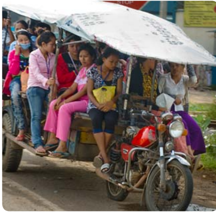
Garment workers packed onto their daily commute.

The garment industry in Cambodia employs over 500,000 workers and is a $5 billion dollar export industry. Thousands of young women travel from rural villages to garment